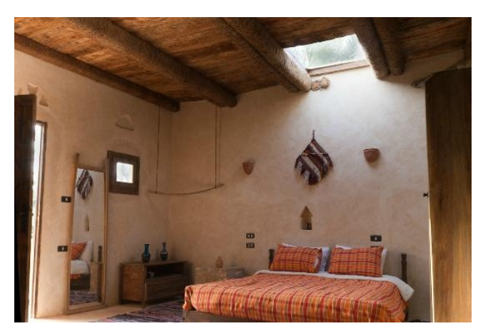
??_Have an amazing night in Siwa

Ghaliet is a unique SPA Ecolodge just located nearby Amoun Temple and Alexander the greatest oracle in Siwa Oasis. It has been built by nature and designed among palm trees. you can feel the history and the great ancient stories of Alexander the great while you are in Ghaliet. Enjoy nature, organic design, organic food, and different health programs. The ecolodge includes 12 cozy rooms; each room has its special personality and feeling. You can enjoy staying in the upper rooms with the transparent glass ceiling opening and you feel like you are sleeping in heaven. Also, you can experience the unique outdoor privacy in the lower rooms with their private backyard.