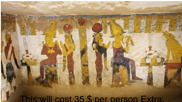
This will cost 35 $ per person Extra.

Visit Bawiti , Bawiti is the Capital of Bahariya Oasis , Then Visit the Museum of the golden mummies and the temple of Ain El Muftella, Bahariya Oasis , You will have lunch in Bahariya Oasis before driving to Hurghada