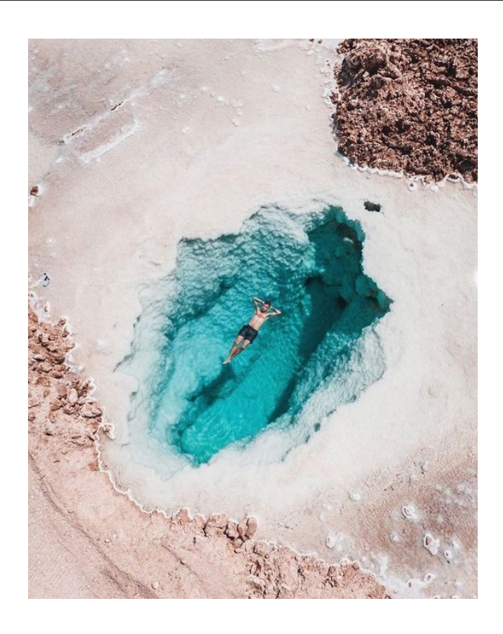
at 11:00 Then proceed to (Cleopatra's bath )The spring of the sun. It has been mentioned by travelers to Siwa, The legend maintains that Cleopatra swam here,