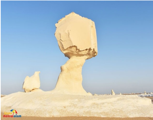
The chicken-shaped rock

There are hundreds of images here each one is reminiscent of an animal- Chicken- A sphinx, Camels, tents, Mushrooms