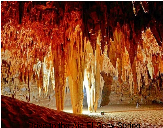
Drive to the Ain El-Serw Spring

The Magic Spring (also known as Ain El Serw, This Spring is probably the most famous spring in the White Desert National Park. Arabic: ??? ????? in Arabic El-Serw means secret: (Secret Spring) refers to the Secret of this magical water Spring. The water comes to a higher level when any human or animal approaches this water spring and stops when they leave away. Nobody knows exactly where the water comes from and How this happens