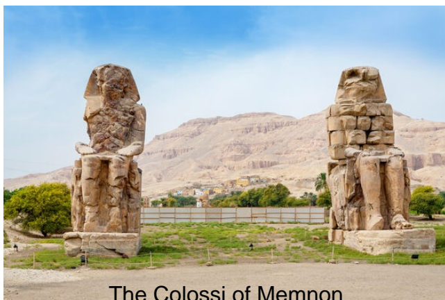
The Colossi of Memnon

The final resting place of Egypt's rulers from the 18th to the 20th dynasty, it is home to tombs including the great Pharaoh Ramses II and boy Pharaoh Tutankhamen. The tombs were well stocked with all the material goods a ruler might need in the next world. Most of the decoration inside the tombs is still well preserved. If you wish to visit the Tomb of The young Pharaoh Tutankhamun . It costs 300 Egyptians Pounds Extra