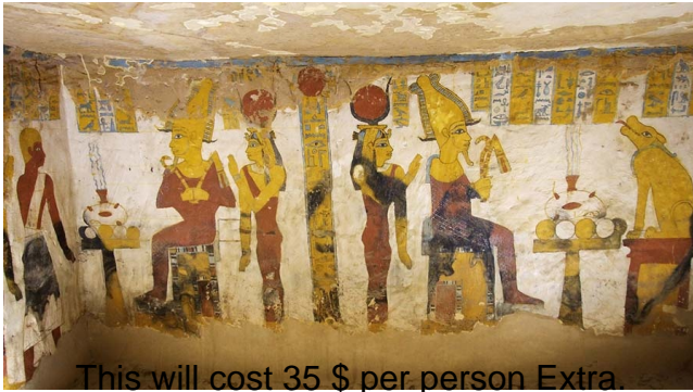
This will cost 35 $ per person Extra

Visit Bawiti , Bawiti is the Capital of Bahariya Oasis , Then Visit the Museum of the golden mummies and the temple of Ain El Muftella, Bahariya Oasis , You will have lunch in Bahariya Oasis before driving to Cairo