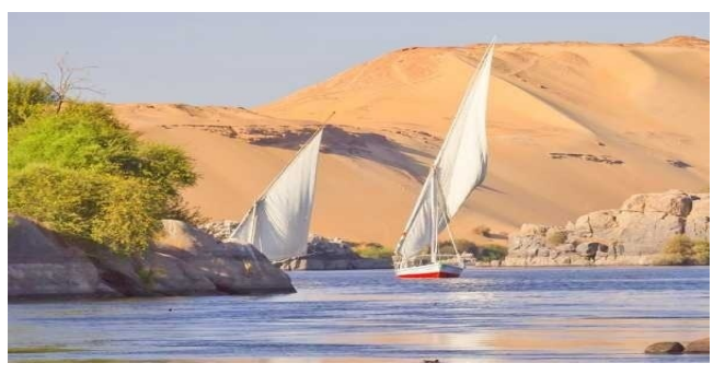
Optional trip to the Nubian village