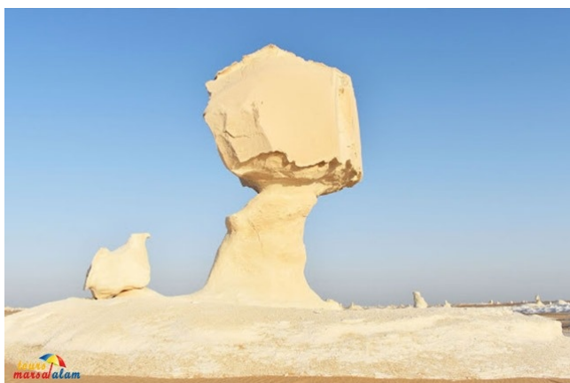
The chicken-shaped rock

There are hundreds of images here each one is reminiscent of an animal- Chicken- A sphinx, Camels, tents, Mushrooms