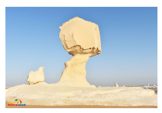
The chicken-shaped rock