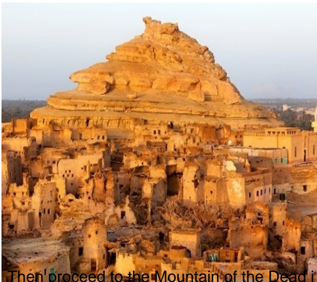
Then proceed to the Mountain of the Dead

in Siwa oasis were used in the construction of the fortress, as they helped to strengthen the wall, Rain has unfortunately proved to be more destructive to the fortress than any human invaders. the fortress was built in the 13th century and served as the center of Siwan life for over 800 years. The fortress' mosque is still in use today, with many of the homes restored, and some even turned into local guesthouses.