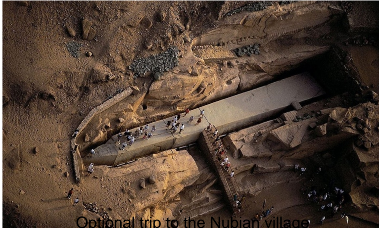
Optional trip to the Nubian village

The large unfinished obelisk in the Northern Quarries has provided valuable insight into how these monuments were created, although the full construction process is still not entirely clear. Three sides of the shaft, nearly 42m long, were completed except for the inscriptions. At 1168 tonnes, the completed obelisk would have been the single heaviest piece of stone the Egyptians ever fashioned.