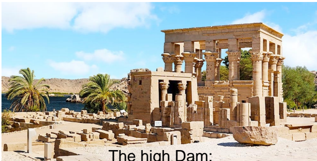
The high Dam:

Built to honor the goddess Isis, this was the last temple built in the classical Egyptian style. Construction began around 690 BC, and it was one of the last outposts where the goddess was worshipped.