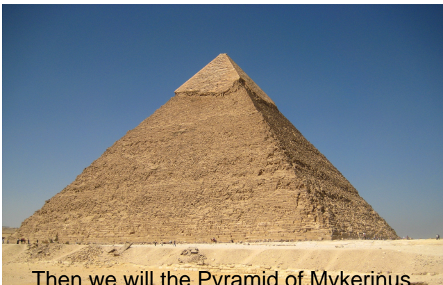
Then we will the Pyramid of Mykerinus.

If you wish to visit the burial chamber of King Chephren . You can ask the tour guide to buy it for you it costs 100 l. E per person( 7 $ per person)