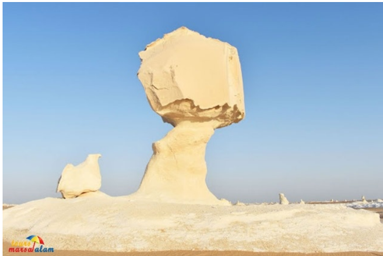
The chicken-shaped rock.

There are hundreds of images here each one is reminiscent of an animal- Chicken- A sphinx, Camels, tents, Mushrooms.